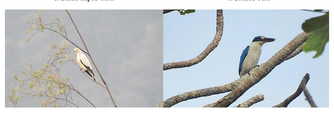
g. Pied Imperial Pigeon