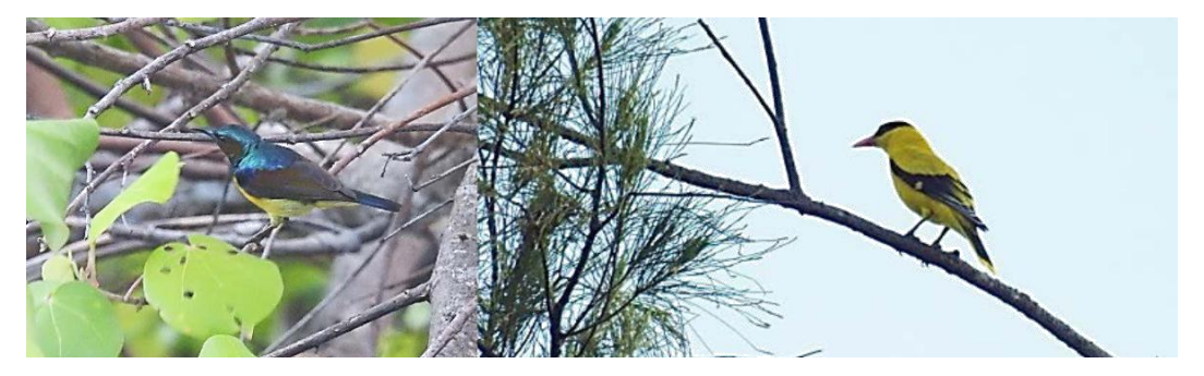
i. Olive-backed Sunbird