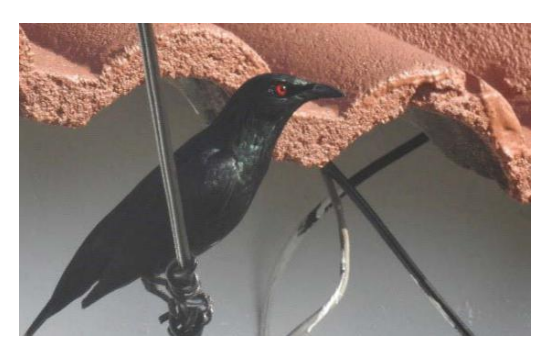
k. Asian Glossy Starling