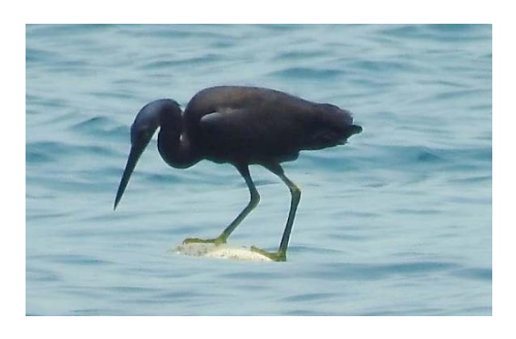
a. Pacific Reef Egret